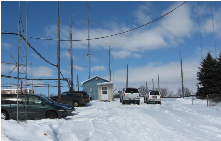
The Shack in the Farm (more antenna's then a porcupine)

It was a fun weekend at W0AIH, despite conditions not being the best at the bottom of the cycle. It wasn't as warm and exotic as Belize, or as historical as operating from a WWII German bunker in Jersey, but it was a FB ham radio experience. Next year? If my XYL approves, I'll be in ...?